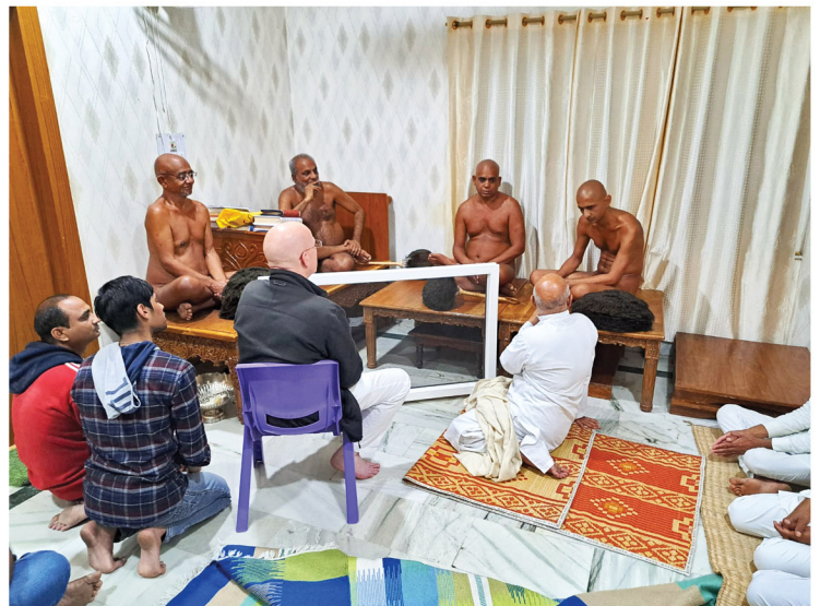
Satsang with Digambar Monks