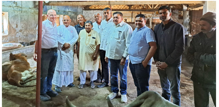
Panjara Pole Rapar - Samanji and Rapar Group