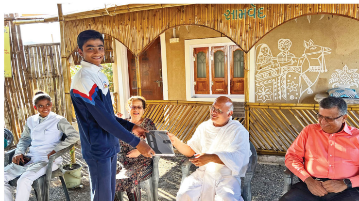
New Year Diary Gift