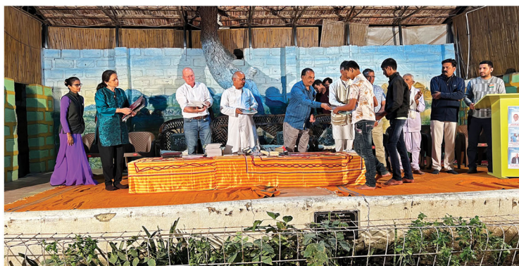
Science Fair Award Ceremony