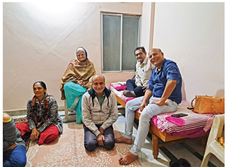
Samanji's Satsang with Family