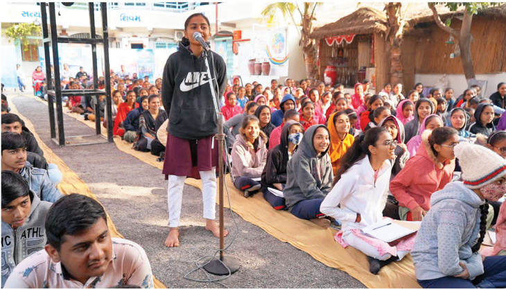
Student Asking a question in the Shibir