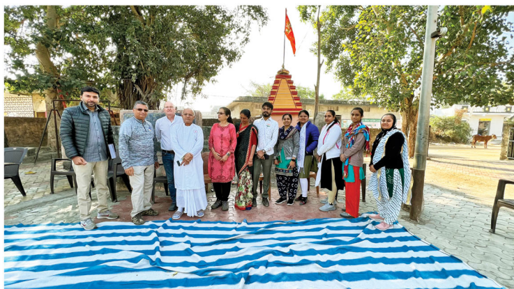
Blessing and notebook distribution @ Sanakhala School