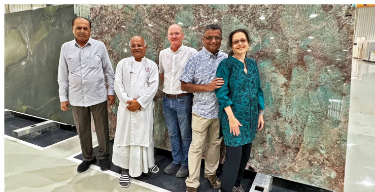
Visiting Om Marble