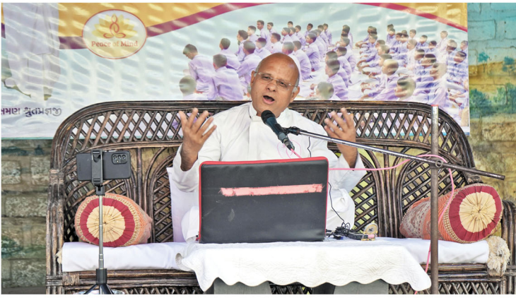
Samani in the Purusharth School Shibir