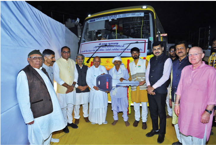
Donation of School Bus from M