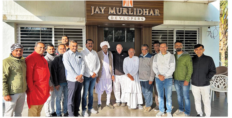
Group Photo at Shree Murlidhar Farm House Rakot