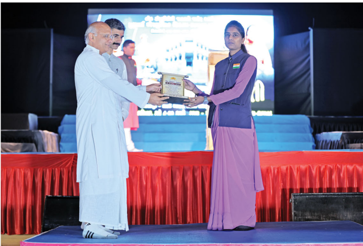
Peace of Mind Foundation giving Best Teacher Award at Purusharth School