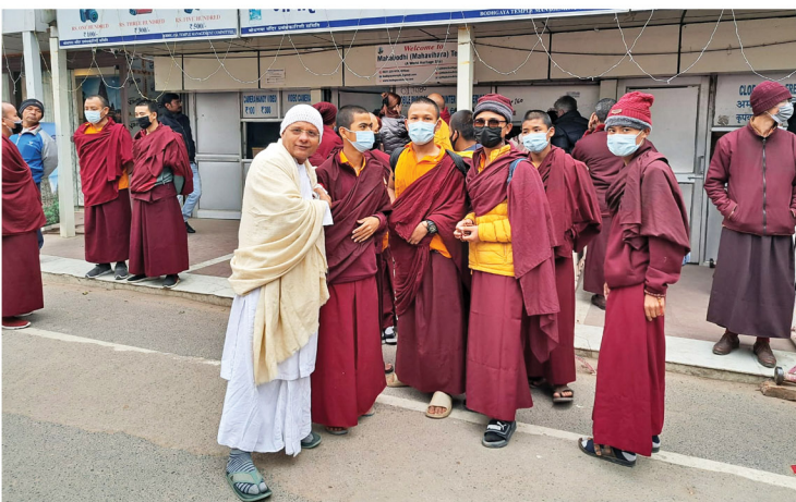
Group photo with Buddhist Monks