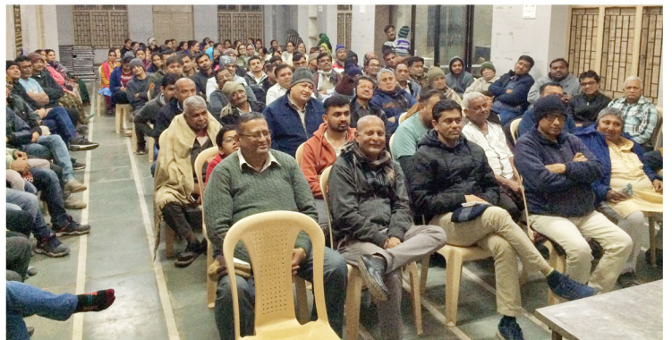
Pravachan at Vividhlakshi Hall Rapar