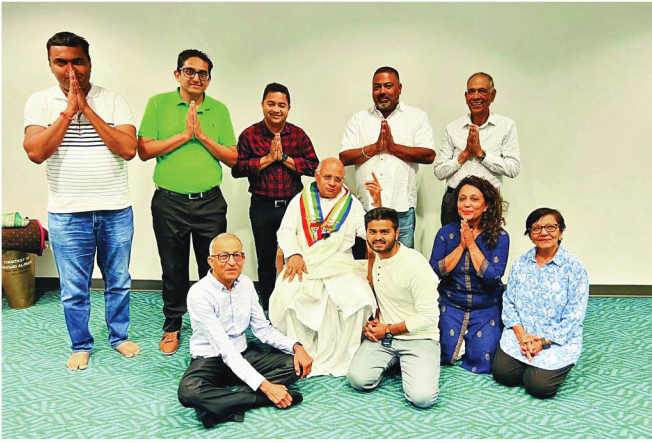
Vancouver group welcoming Samanji at Airport