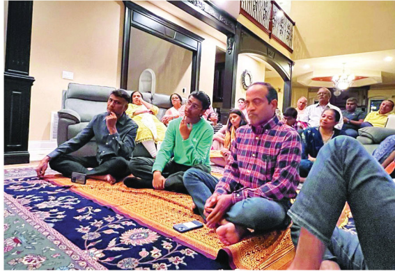
Guru Purnima - Oak Brook - IL