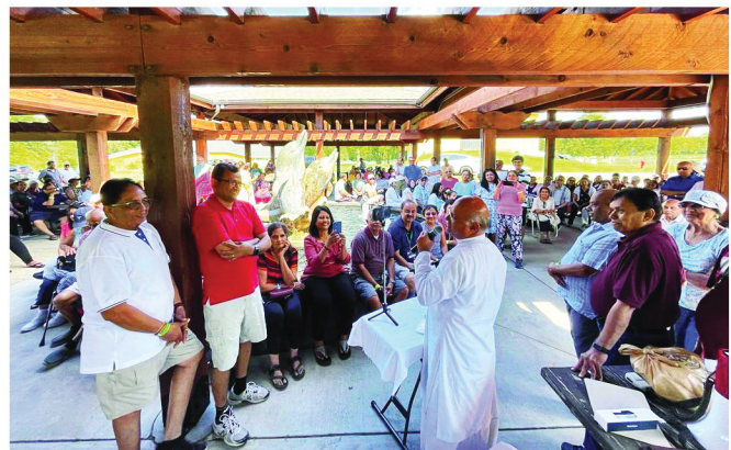
Samanji talking with Senior Citizen in Picnic